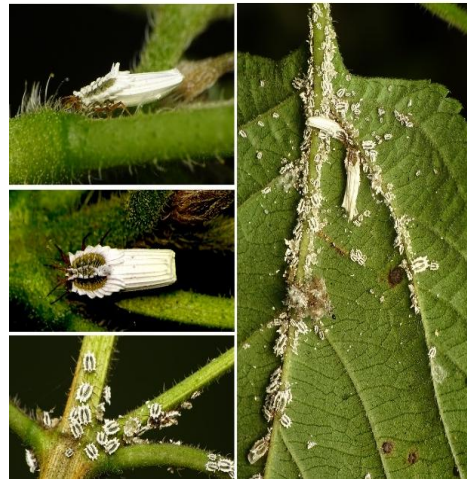
Greenhouse Orthezia, Orthezia insignis