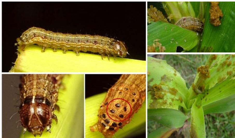
Fall armyworm, Spodoptera frugiperda