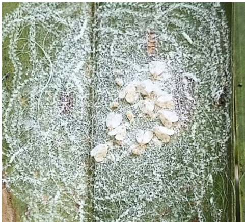
Rugose Spiraling Whitefly (RSW), Aleurodicus rugioperculatus