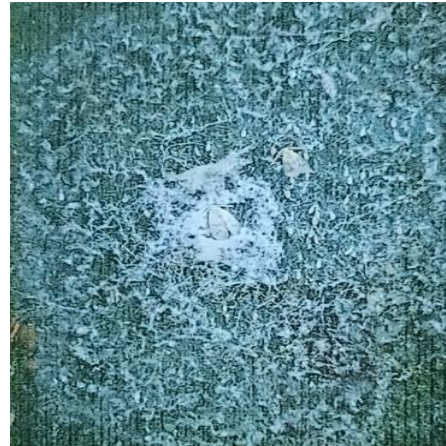
Bondar's Nesting Whitefly (BNW), Paraleyrodes bondari