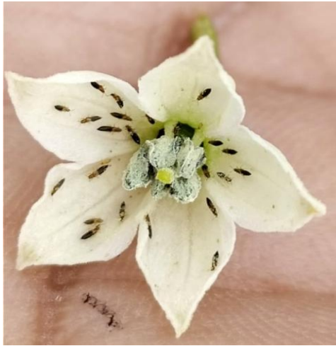
Chilli black thrips, Thrips parvispinus